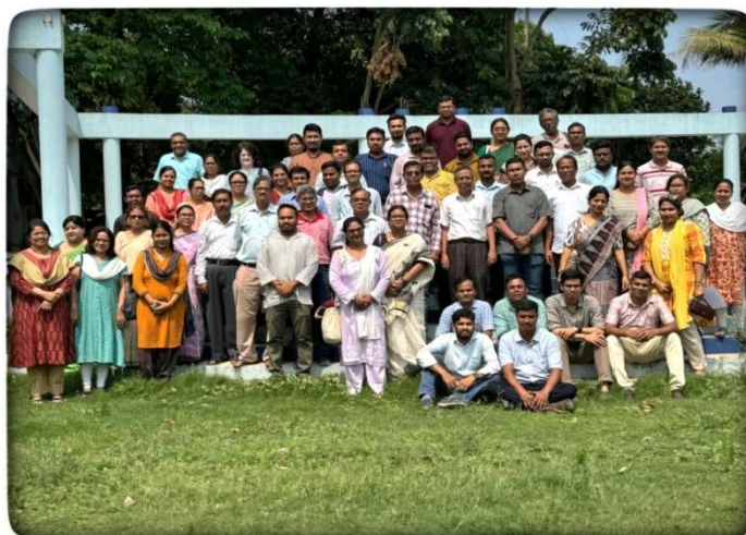
Members of Teachers' Council

The TC of SCC is proud of its annual bilingual publication, Sampan -where the literary aspiration of the faculty finds expression.