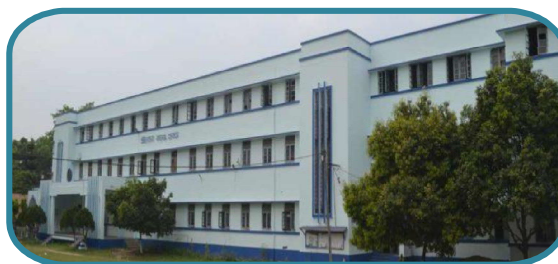
Panoramic view of the College