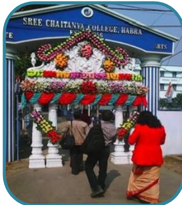
Saraswati Puja Celebration